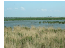
Great Fish Pond

The second day we will spend at the Great Fish Pond (Nagy Halastó) in Hortobágy which is regarded as a birding Eldorado in Hungary. Over 300 bird species have been observed here so far by birders and in almost every season ten and hundred thousands of birds can be seen. The system of fishponds of Hortobágy Halastó covering 2073 hectares was created in 1915 in an alkaline grassland area called Bad Lands. Formerly there were 17 ponds, while now 7 are out of use being covered by reed or other marsh vegetation. Great Fish Pond is a Ramsar site maintaining breeding and migrating waterfowl populations of outstanding importance, so it is considered as one of the most important water bird habitats in Europe.