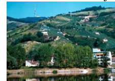
Kopasz Hill, Tokaj

Based on the arrival of your plane if we have time we will go to a close abandoned stone mine, where sometimes Eagle Owl can be observed. Above the mine Ravens or raptors might appear. After visiting the abandoned stone mine we will go to Kopasz-hill near Tokaj, where we will check wine yards and bushes, looking for Rock Bunting. With some luck we can find Rock Thrush. We have dinner at the hotel or a nearby restaurant.