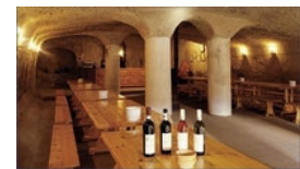
The Thummerer Cellar

Optional program - Winetasting: In the evening we can visit a very good cellar in Noszvaj which has won several gold medals in Hungary and abroad. We will taste the famous local wine Bikavér (Bulls Blood) which is a special cuvee from different redwines. .