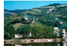
Kopasz Hill, Tokaj

Based on the arrival of your plane if we have time we will go to a close abandoned stone mine, where sometimes Eagle Owl can be observed. Above the mine Ravens or raptors might appear. After visiting the abandoned stone mine we will go to Kopasz-hill near Tokaj, where we will check wine yards and bushes, looking for Rock Bunting. With some luck we can find Rock Thrush. We have dinner at the hotel or a nearby restaurant.