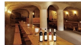
The Thummerer Cellar

Optional program - Winetasting: In the evening we can visit a very good cellar in Noszvaj which has won several gold medals in Hungary and abroad. We will taste the famous local wine Bikavér (Bulls Blood) which is a special cuvee from different redwines. .