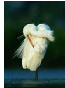
Great White Egret

After lunch we will go for birding and spend the afternoon by spotting waterfowls. We will see Great White Egrets and Grey Herons. Ducks, shorebirds, gulls and the variety of raptor species even increases the spectacle. (Great White Egret is a symbolic bird of Lake Fertő and the Hungarian nature conservation, since it almost died out in the 19 th century. But thanks to the work of the “Egret Guards” who were guarding Egrets and Egret nests by guns its population started to grow.) During our birding in the reedbeds the songs of Moustached Warblers, Bluethroat and Savi’s Warblers can be also heard.