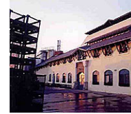
Neszmély, Hilltop Cellar