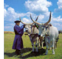
Gray Cattles at Hortobágy

This is our last day and we don't want to miss the most famous Hungarian landscape the Hortobágy . By far Hortobágy is the most marketed Pusta and rural environment in Hungary and it has an extensive tourism. In order to get there we get up early morning and drive to Hortobágy. In Hortobágy we will have some 5 hours and will see the most famous tourist attractions like the 9-arch bridge, the Pusta, and Hortobágy the village.