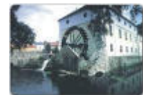
Watermill in Tata