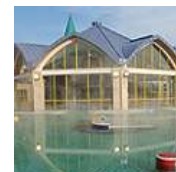
Spa in Sárvár

In the evening if our pension has the facility and the weather is nice we will make our traditional Hungarian food the Rablohus (Robber's meat). It's actually meat, onion, potato, bacon roasted on a spit.