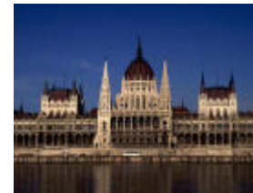
Building of Parliament

Our tour will start in Budapest at the airport, where we pick you up. We will drive you to the hotel equipped with good quality rooms where you will be accommodated for the first night. After some refreshment we will start our Budapest sightseeing tour. Since our time will be limited we will visit the "must-see" sights of Budapest the Buda Castle, Matthias Church, Basilica, Parliament, Heroes Square and the City Park .