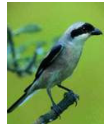
Lesser Grey Shrike

We will have our sandwich lunch in this area and continue birding. We will see White Storks and passing through small villages we can see how these birds live together with humans and build nests on the chimneys. If we are fortunate, beside many other species we can see here Lesser Grey Shrike and Red Kite as well.