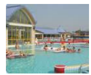
Spa in Sárvár

In the evening if our pension has the facility and the weather is nice we will make our traditional Hungarian food the Rablohus (Robber's meat). It's actually meat, onion, potato, bacon roasted on a spit.