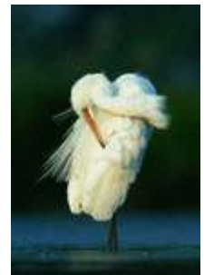
Great White Egret

After lunch we will go for birding and spend the afternoon by spotting waterfowls. We will see Great White Egrets and Grey Herons. Ducks, shorebirds, gulls and the variety of raptor species even increases the spectacle. (Great White Egret is a symbolic bird of Lake Fertő and the Hungarian nature conservation, since it almost died out in the 19 th century. But thanks to the work of the “Egret Guards” who were guarding Egrets and Egret nests by guns its population started to grow.) During our birding in the reedbeds the songs of Moustached Warblers, Bluethroat and Savi’s Warblers can be also heard.