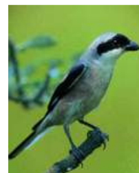
Lesser Grey Shrike

We will have our sandwich lunch in this area and continue birding. We will see White Storks and passing through small villages we can see how these birds live together with humans and build nests on the chimneys. If we are fortunate, beside many other species we can see here Lesser Grey Shrike and Red Kite as well.