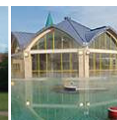
Spa in Sárvár

In the evening if our pension has the facility and the weather is nice we will make our traditional Hungarian food the Rablohus (Robber's meat). It's actually meat, onion, potato, bacon roasted on a spit.