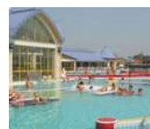
Spa in Sárvár

In the evening if our pension has the facility and the weather is nice we will make our traditional Hungarian food the Rablohus (Robber's meat). It's actually meat, onion, potato, bacon roasted on a spit.