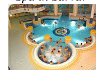
Spa in Sárvár