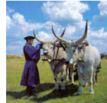
Gray Cattles at Hortobágy

This is our last day and we don't want to miss the most famous Hungarian landscape the Hortobágy . By far Hortobágy is the most marketed Pusta and rural environment in Hungary and it has an extensive tourism. In order to get there we get up early morning and drive to Hortobágy. In Hortobágy we will have some 5 hours and will see the most famous tourist attractions like the 9-arch bridge, the Pusta, and Hortobágy the village.