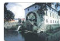
Watermill in Tata