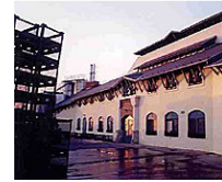
Neszmély, Hilltop Cellar