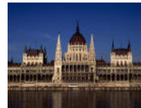
Building of Parliament

Our tour will start in Budapest at the airport, where we pick you up. We will drive you to the hotel equipped with good quality rooms where you will be accommodated for the first night. After some refreshment we will start our Budapest sightseeing tour. Since our time will be limited we will visit the "must-see" sights of Budapest the Buda Castle, Matthias Church, Basilica, Parliament, Heroes Square and the City Park .